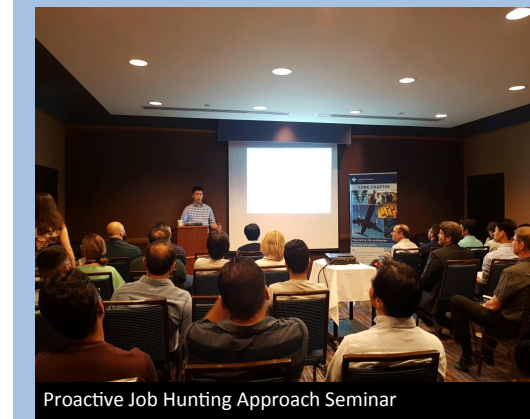
Proactive Job Hunting Approach Seminar

In May, 49 EITs participated in our Licensure Assistance Program (LAP), which was 63% more than the previous year. More importantly, the ratio of female EITs increased to 20.4%. This was exciting news for us as we were working hard to support the Women-in-engineering (WIE) 30 by 30 program initiated by PEO (raising the representation of women within the engineering field to 30% by 2030). The support from our engineers is the key to making this program successful every year, and we appreciate all engineers' valuable time and guidance for our EITs throughout the entire LAP. I look forward to seeing more engineers and EITs participate in LAP 2020.