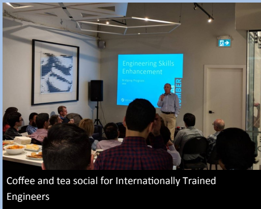
Coffee and tea social for Internationally Trained Engineers

WIE Committee started off the year with a successful Smart City event followed by an awareness session geared towards internationally trained engineers of resources available towards P, Eng. license. This year's focus is on PEO's 30 by 30 Action Plan.