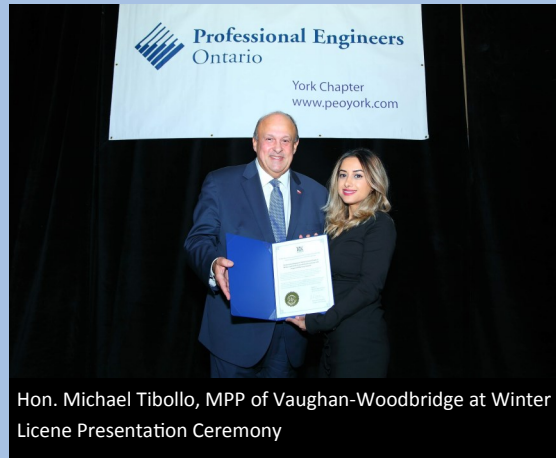
Hon. Michael Tibollo, MPP of Vaughan-Woodbridge at Winter License Presentation Ceremony

In 2019, the Government Liaison Program (GLP) Committee spent significant efforts to cultivate new relationships with the newly elected Members of the Provincial Parliament (MPPs) as a result of the 2018 elections. We also continued to maintain our established relationships with re-elected officials. We understand that this provides a great opportunity for our members' voice to be heard in government. GLP activities in the past year were of great significance as we continued to improve our relationships with the MPPs. With our continued efforts, our goal is to increase engagement in the following year.