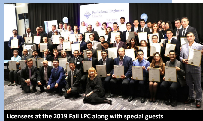
Licensees at the 2019 Fall LPC along with special guests