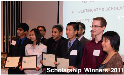
Scholarship Winners 2011